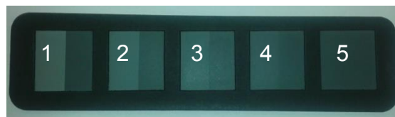
Figure 2: Example of grey scale

The grey scale assessment is done according to ISO 105-A02:1993. In the scale, 1 represents the lowest or worst result, while 5 is the highest or best result.